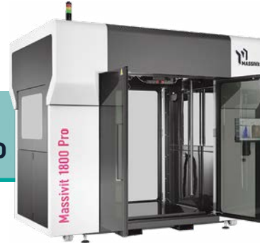
Massivit 1800 Pro